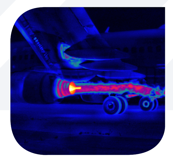
High Dynamic Range enables detailed imaging of a broad range of target temperatures in the same scene