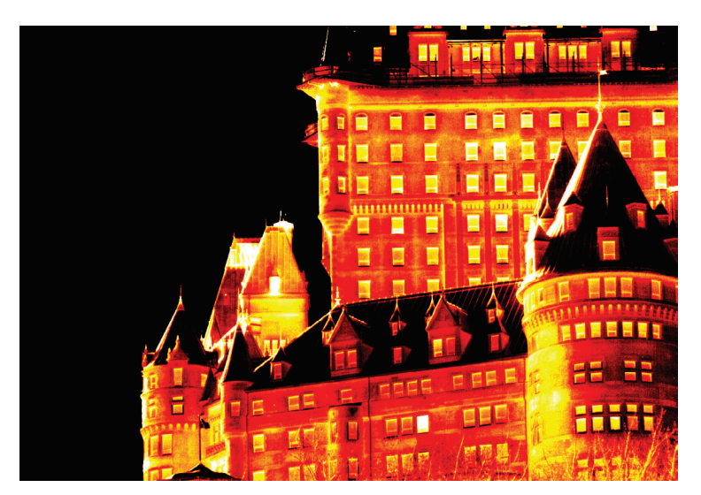
Quebec City's Château Frontenac in infrared

Since its beginning in 2000, Telops has distinguished itself with the quality of its technical personnel and its innovative approach to many technological challenges in the optics field. Today, the expertise of its scientists and the performances of its infrared cameras and hyperspectral imagers are internationally recognized.