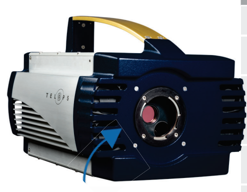
The motorized 8-filter wheel.

Specifications are subject to change without notice. Other configurations are available upon request.