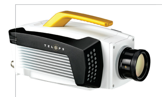
The IP-67 certified enclosure