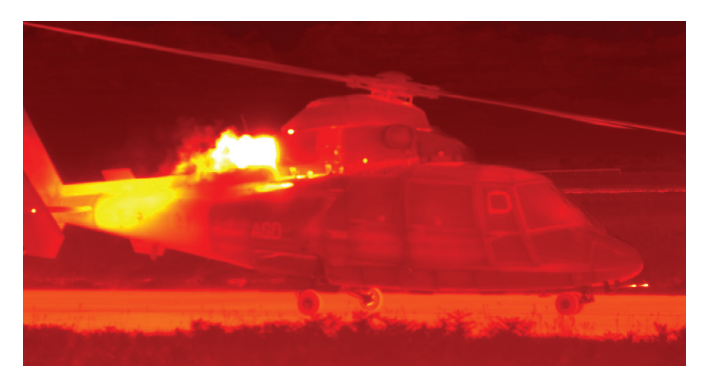
Helicopter IR signature characterization