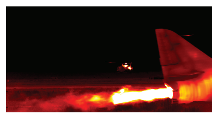
Jet engine IR signature measurement