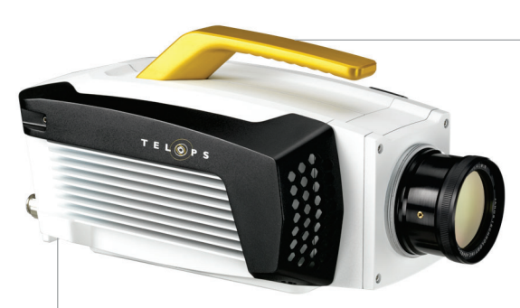
The IP-67 certified enclosure.