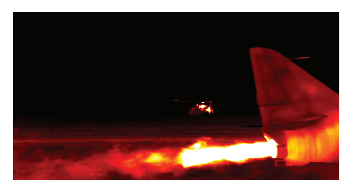
Jet engine IR signature measurement