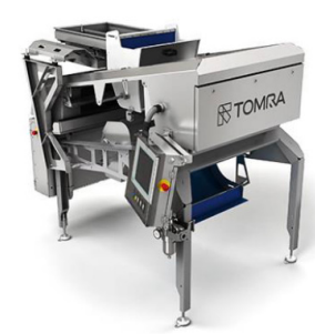
Figure 1: Food sorting system detects defects and inappropriate shapes of fruit and vegetables in the visual & SWIR realm.

tasks. Spectroscopic analysis of food items examines them in terms of their structural make-up and hidden defects by observing their spectral response to specific illumination wavelengths in the visual and SWIR realms (figure 1). For this spectroscopic analysis in SWIR, Xenics has developed a custom-made InGaAs detector for Tomra. This method delivers more information on the goods examined and it enables a more detailed classification in regard to quality and the state of freshness of certain food items and their 'Biometric Signature Identification'. BSI enables to identify slight, otherwise suitability for human consumption. This has led Tomra to the development of a technique that it calls unnoticed chemical and molecular differences in the inspected food items and it serves as a differentiator of their quality and suitability. This development has earned Tomra the 'Excellence in Research and Innovation Award' at the 2015 INC Congress.