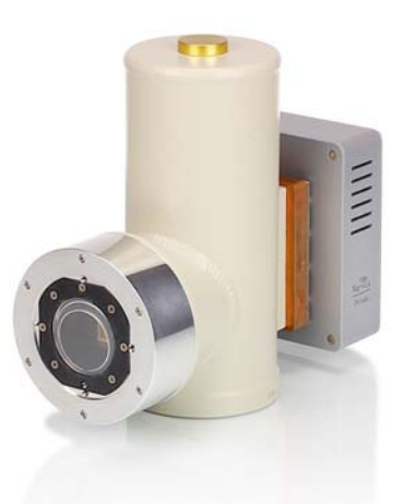
Figure 1. The Xenics Cougar camera containing the InGaAs focal plane detector suited for image capture in the shortwave infrared.

The camera setup consists of two modules: a Dewar (178 x 93 x 207 mm<sup>3</sup>, LxWxH) containing the LN2-cooled InGaAs sensor in vacuum, and a separate housing for the control and read-out circuitry (40 x 100 x 130 mm<sup>3</sup>). The camera interface is provided via standard CameraLink for ease of integration in measurement systems ( Figure 1 ).